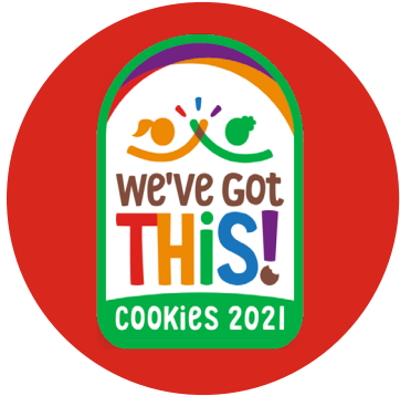
We've Got This Theme Patch

Girls get rewarded sooner with instant rewards! During the 2021 cookie program as girls reach each instant reward level, they receive the reward item from their troop cookie program coordinator (TCPC) right away, no waiting necessary! And this year, that's not all! Troops can also set their own guidelines for the new 2021 Super patch! Girl Scouts receive all other final girl rewards in May 2021.