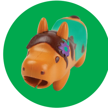
Glow in the Dark Cable Horse