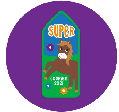
2021 Super Patch