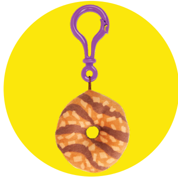
Samoas Plush Dangler